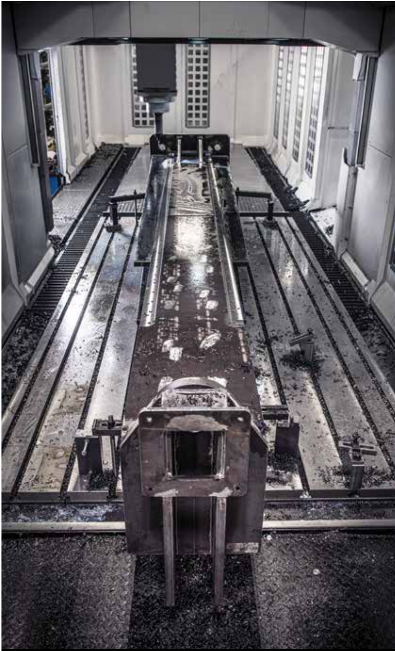
The MCR-A5CII machine's table can take parts up to 80 by 160 in., so the shop put it to the test by processing large components for which all five faces needed to be machined. It was able to perform this in one setup, saving the shop time and money.

However, in recent years the shop has shifted its production whereby Thermofin occupies only about 40 per cent of the capacity, opening up more space for new customers and expanding into new industries. It has even landed some new contracts with the rail transportation industry. Diversification has allowed the company to better serve both structural and pulp and paper industries as well, which is where the company sees its most promising contracts going forward.