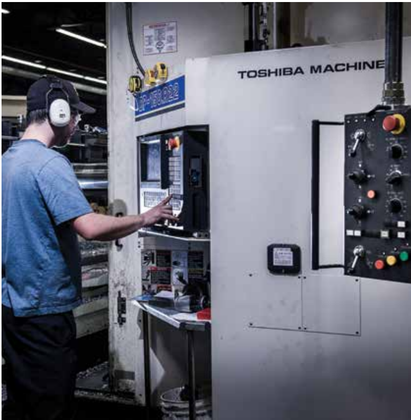
Usinage Superieur recently rearranged its 25,000-sq.-ft. shop to create better production flow with its existing lineup of conventional and CNC milling and turning machines, as well as this large Toshiba BP-150.R22 planer-type horizontal boring machine.

“We needed a machine that even after several years would still have the same repeatability as if it were the first time,” said Dextraze. “We were really impressed with how the boxways allowed the machine to move, as well as its sturdiness. It was also important for us to have local support available.”