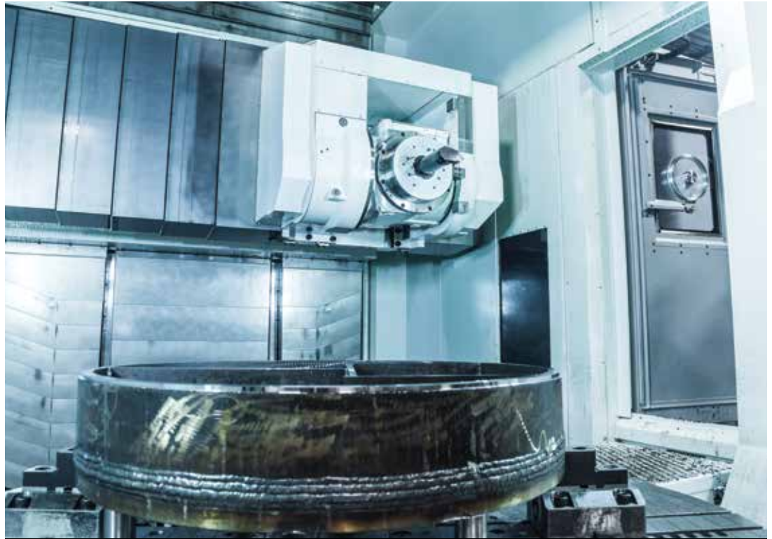
In 2018 the shop wanted to incorporate a large vertical lathe that could be used to machine round parts, without needing to move to a different machine, so it opted for an Okuma VTM-2000YB 5-axis lathe.